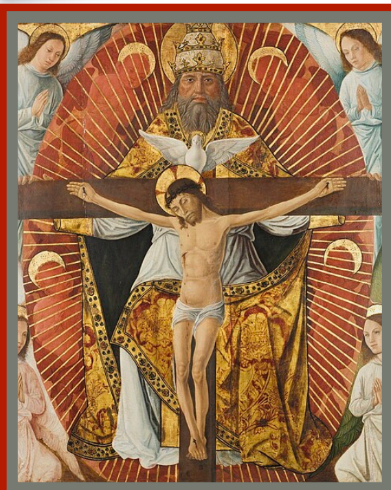
"The Trinity" Detail c. 1455 Laurent Girardin

9136 Riverside Drive Descanso, CA 91916 www.ourladyoflight.church