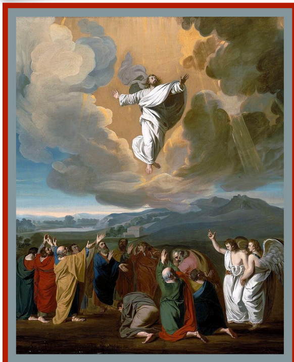
"Ascension" Detail c. 1775 John Singleton Copley

Daily Mass Mondays and Wed.-Fri. 8:00 AM