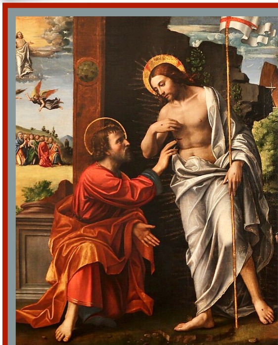
"Incredulity of Saint Thomas" Detail c. 1520 Paolo Moranda Cavazzola

9136 Riverside Drive Descanso, CA 91916 www.ourladyoflight.church