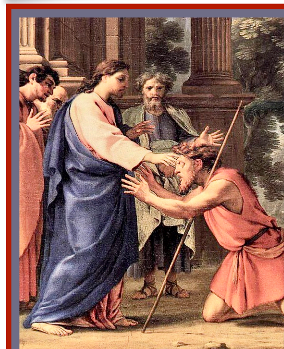
"Christ Healing the Blind Man" Detail c. 1645 Eustache Le Sueur

9136 Riverside Drive Descanso, CA 91916 www.ourladyoflight.church