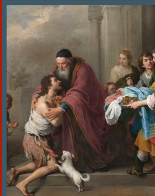
"The Return of the Prodigal Son" Detail c. 1682 Bartolomé Esteban Murillo

There are many terrific opportunities within our family of faith, to Love, Grow & Serve. Please see our lists of Activities, Organizations, & Events, inside this bulletin!