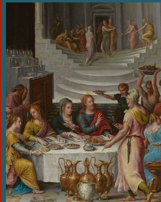
"The Wedding Feast at Cana" Detail c. 1575-1580 Lavinia Fontana