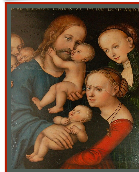
"Christ Blessing the Children" Detail c. 1537 Lucas Cranach the Younger

There are many terrific opportunities within our family of faith, to Love, Grow & Serve. Please see our lists of Activities, Organizations, & Events, inside this bulletin!