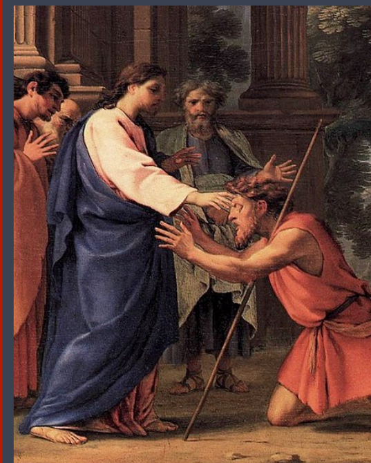
"Christ Healing the Blind Man"