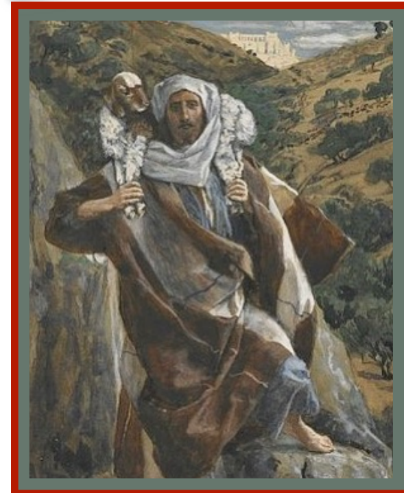
"The Good Shepherd" Detail c. 1886-1894 James Tissot

9136 Riverside Drive Descanso, CA 91916 www.ourladyoflight.church