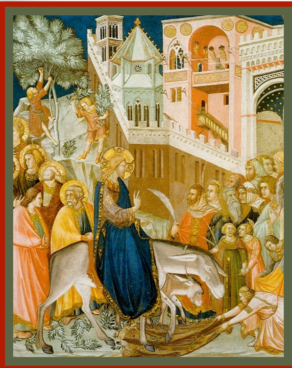
Christ's Entry Into Jerusalem Fresco detail c. 1306 Pietro Lorenzetti

There are many terrific opportunities within our family of faith, to Love, Grow & Serve. Please see our lists of Activities, Organizations, & Events, inside this bulletin!