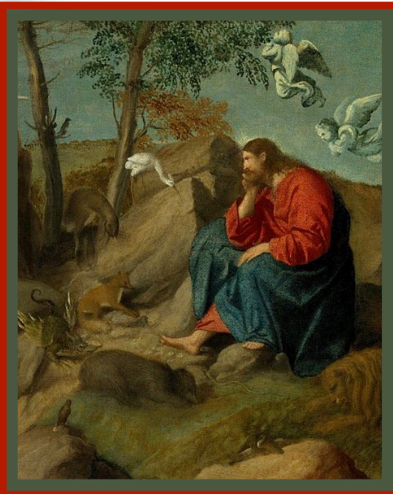
"Christ in the Wilderness" Detail c. 1500's Moretto da Brescia

There are many terrific opportunities within our family of faith, to Love, Grow & Serve. Please see our lists of Activities, Organizations, & Events, inside this bulletin!