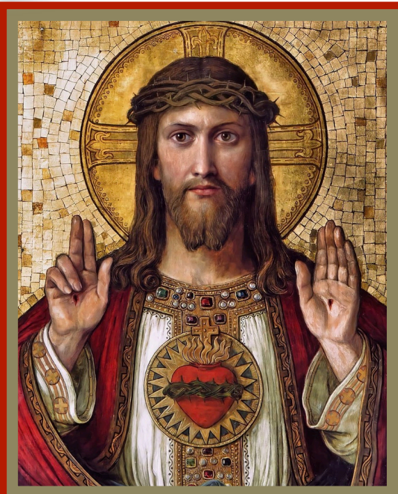
"Jesus Christ, King of the Universe" Date Unknown Artist Unknown

9136 Riverside Drive Descanso, CA 91916 www.ourladyoflight.church