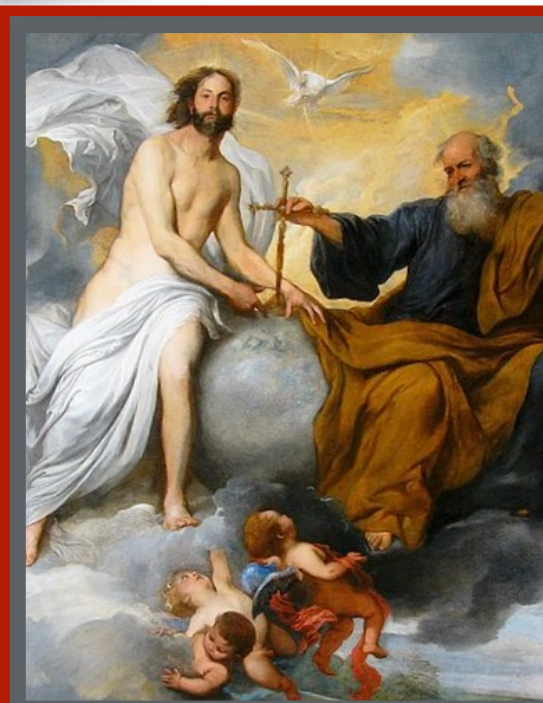
"The Holy Trinity"