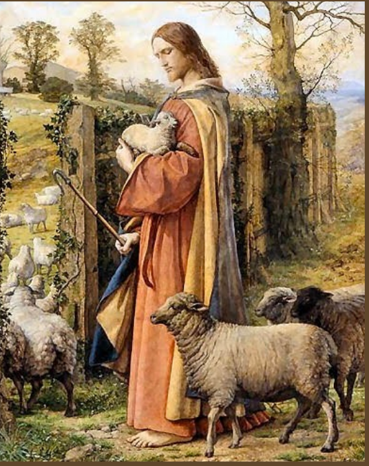
"One Shepherd, One Gatekeeper" Date Unknown Artist Unknown

There are many terrific opportunities within our family of faith, to Love, Grow & Serve. Please see our lists of Activities, Organizations, & Events, inside this bulletin!