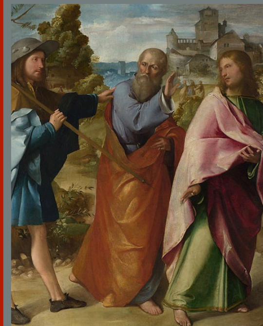
"The Road to Emmaus" Detail c. 1516-17 Altobello Melone

There are many terrific opportunities within our family of faith, to Love, Grow & Serve. Please see our lists of Activities, Organizations, & Events, inside this bulletin!