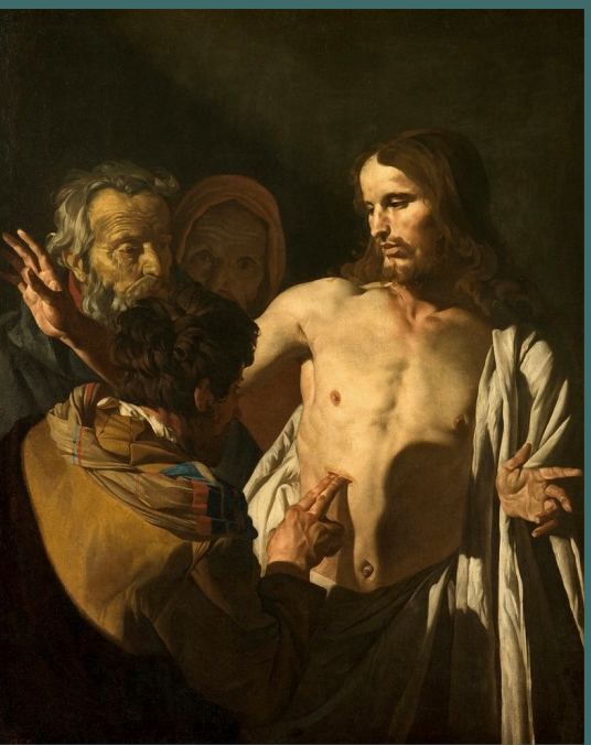
Doubting Thomas Date Unknown Artist Unknown

There are many terrific opportunities within our family of faith, to Love, Grow & Serve. Please see our lists of Activities, Organizations, & Events, inside this bulletin!