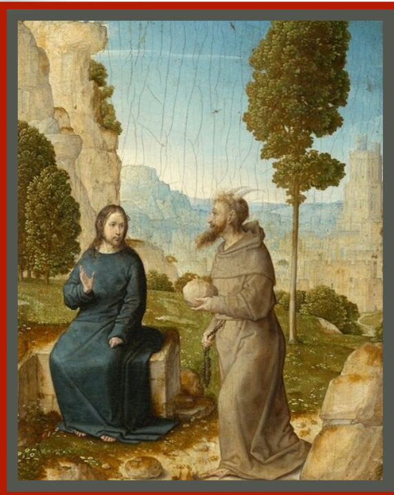
"The Temptation of Christ" Detail c. 1500-1504 Juan de Flandes

There are many terrific opportunities within our family of faith, to Love, Grow & Serve. Please see our lists of Activities, Organizations, & Events, inside this bulletin!