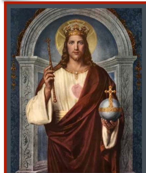
Christ, King of the Universe Detail Artist Unknown

There are many terrific opportunities within our family of faith, to Love, Grow & Serve. Please see our lists of Activities, Organizations, & Events, inside this bulletin!