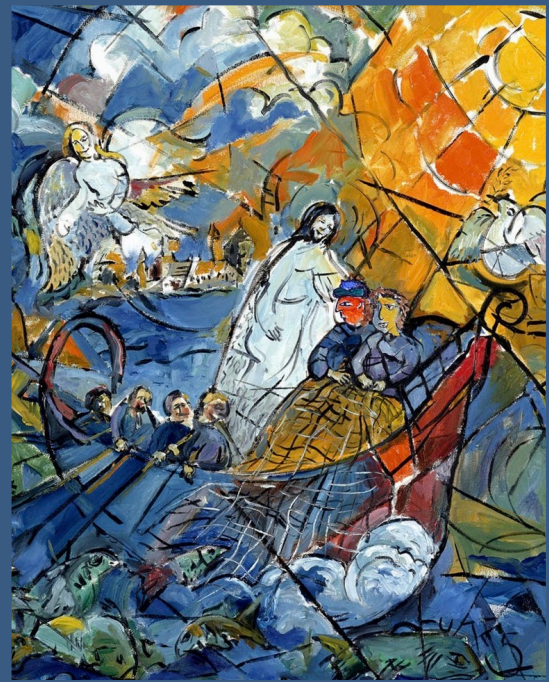
Fishers of Men Detail Unknown Artist

There are many terrific opportunities within our family of faith, to Love, Grow & Serve. Please see our lists of Activities, Organizations, & Events, inside this bulletin!