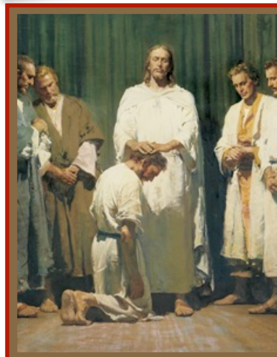
Christ Ordaining the Twelve Apostles

9136 Riverside Drive Descanso, CA 91916 www.ourladyoflight.church