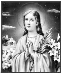
Saint Maria Goretti is the patron saint of chastity, purity, victims of rape, young girls, and forgiveness.