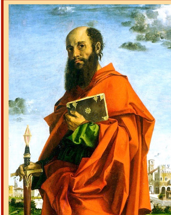
Saint Paul Detail, 1482 Bartolomeo Montagna

9136 Riverside Drive Descanso, CA 91916 www.ourladyoflight.church