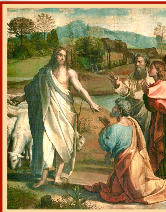
Handing over the Keys Detail, c. 1515 Raphael

9136 Riverside Drive Descanso, CA 91916 www.ourladyoflight.church