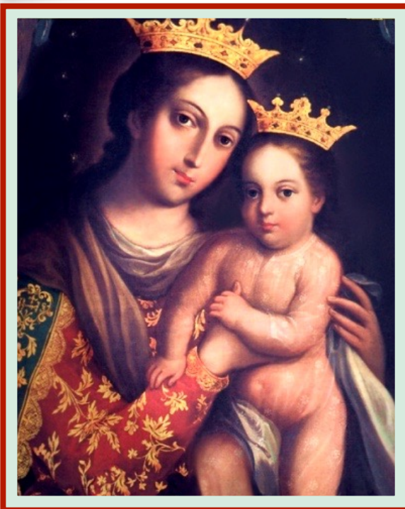
Our Lady of Refuge Detail, c. 1750 Joseph de Paez

9136 Riverside Drive Descanso, CA 91916 www.ourladyoflight.church